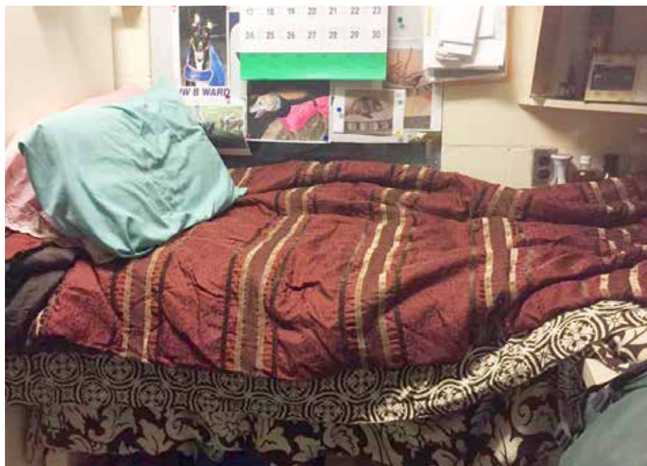
The Greyhounds' caretakers made their beds right alongside the hounds' crates as they waited for Hurricane Irma to pass.

As Hurricane Irma approached, the dogs were exercised in sprint paths up until the conditions worsened. Daily routines were kept as normal as possible, including turn-outs and feeding schedules. They were in familiar surroundings with people they knew, loved, and trusted. Trainers, kennel owners, and kennel staff were there to maintain a calm environment, protect, and care for them.