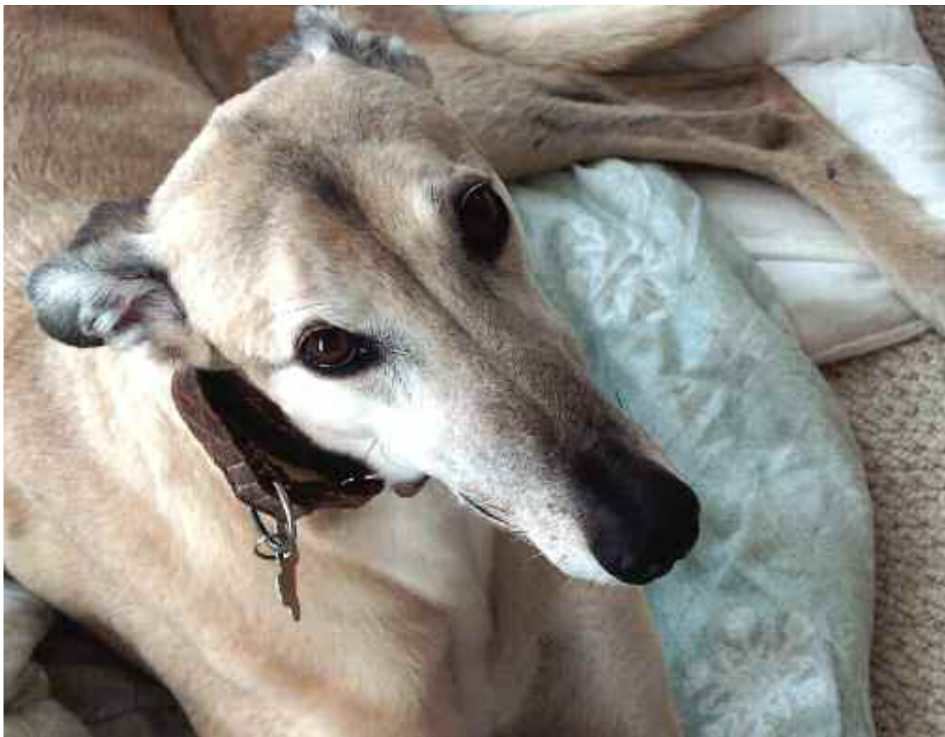
Lexus, adopted by Tamara and Frank Ciocci of St. Michaels, Md.

phenobarbital, but this usually subsides within a few days. The dosage range of phenobarbital is very large, so it is best to start at a lower dosage, monitor for any decrease in seizure activity, and check phenobarbital blood levels to make sure the dosage gives an adequate blood level for seizure control. Long-term phenobarbital usage may lead to liver damage, so blood chemistries should be checked every six to twelve months.