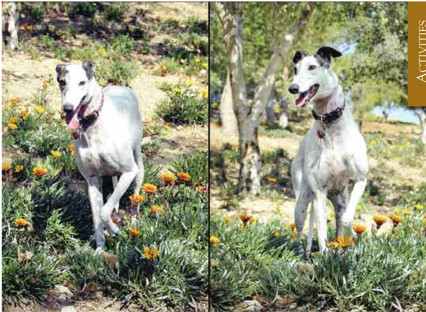
Shooting from ground level makes Amelia look almost regal, as opposed to the ho-hum shot on the left, taken when the photographer was standing up.