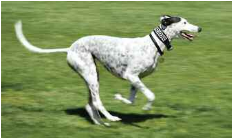
Bella flies through the air! You can feel her speed due to effective panning.