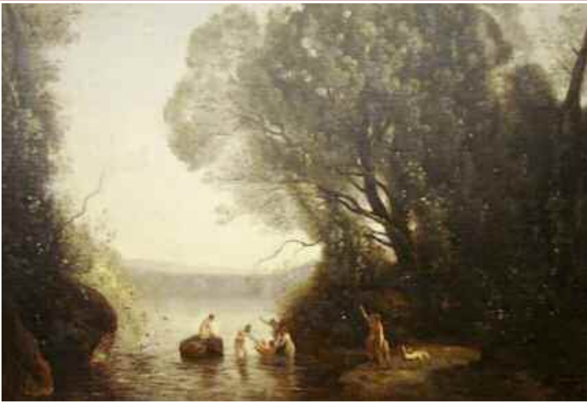
The Bath of Diana , Jean-Baptiste-Camille Corot, c. 1855, Dallas Museum of Art.