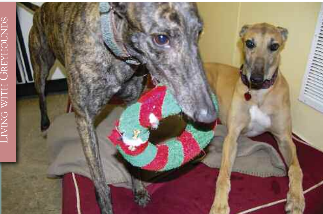
Bridget (Bright Side) and Golden Bear, on the day they were adopted by the Fishers in 2009.