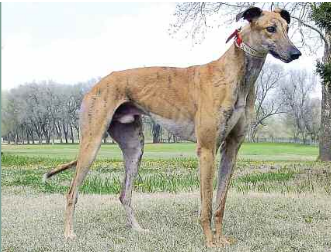
Kiowa Sweet Trey was inducted into the Hall of Fame in October 2011. Greyhound Hall of Fame