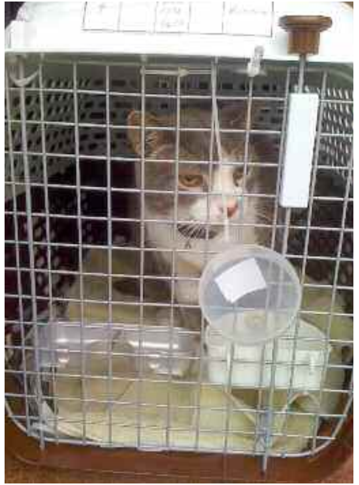
Rawwwr! Simon is ready for the trip to be over, thank you very much.

In October, my husband and I flew to Boston to find a place to rent. Once that was accomplished, he stayed there because of work demands. I flew back to Ireland to coordinate the move of our belongings and pets.