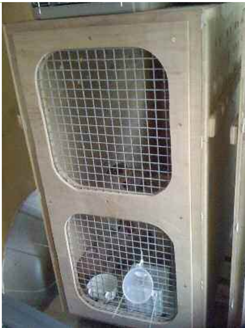
The beautiful crates for the dogs' transatlantic flight were custom built by Wes of Breeney Kennels in Belfast.

While I was on the phone with my husband, we figured out an impossibly tight, yet somehow plausible, course of action for our move. The plan would work just as long as not one thing went wrong. We would be moving to New England this time and, once again, would be battling airline temperature restrictions for flying pets. We checked the average temperatures for Boston, and realized the pets would have to fly by the end of October to beat the cold. Otherwise we'd have to stay until spring. Not only did we have to arrange an international move but we also had a planned vacation, a last-minute business trip and a business meeting to throw in the mix. We had six weeks from the time we got the green light to the time we would all be back together stateside.