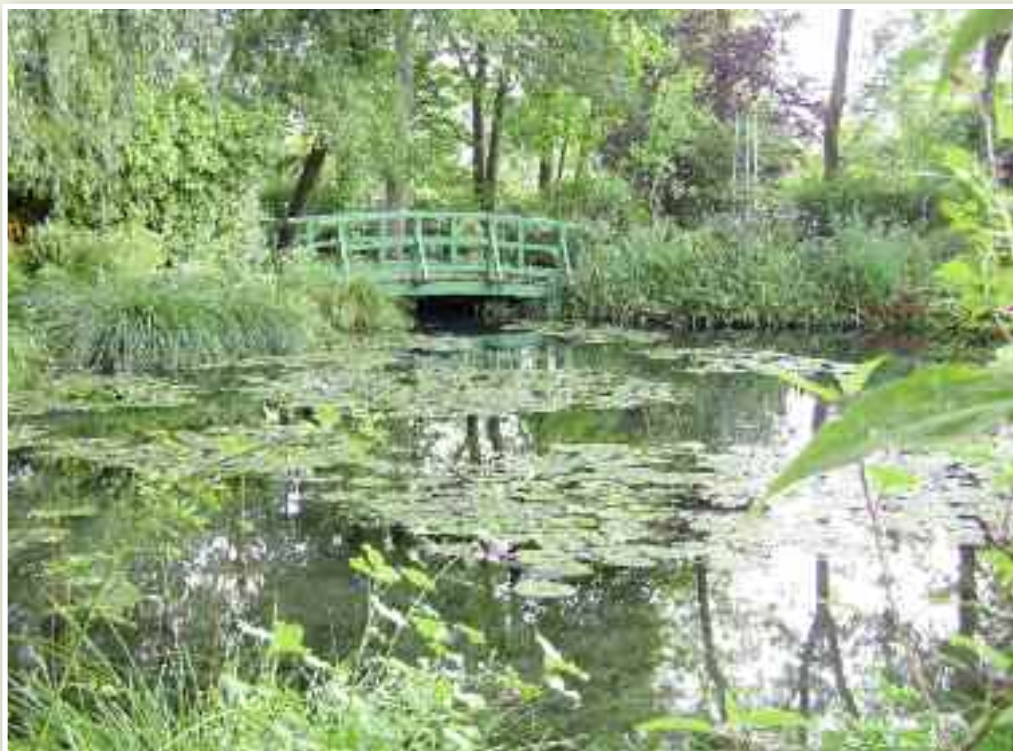
This September 2009 photograph of the pond at Giverny bears a close resemblance to the pond and bridge on the book's cover.