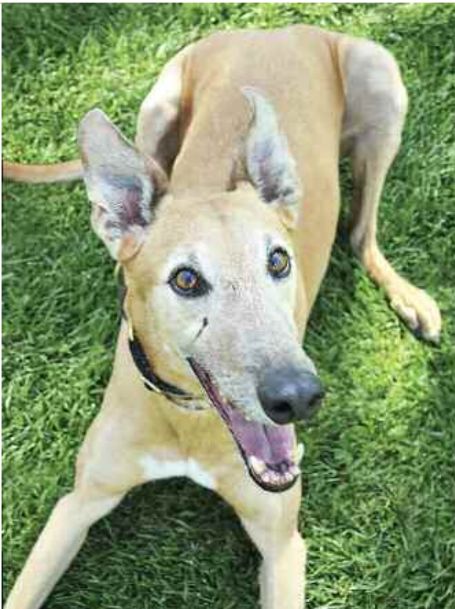
Tuscany is as cute as can be! In this photograph, which was taken while standing directly above him, he looks young and playful.