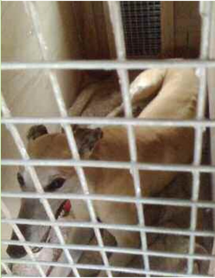
Rob, comfortably settled in his crate, waits to board the plane.