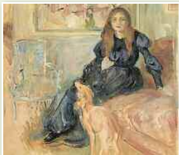
Julie Manet and her Greyhound Laertes , 1893, Musée Marmottan Monet, Paris.

was named Laerte; in English, Laertes. After Morisot's death, she left her paintings to her friends. Claude Monet chose Julie Manet and her Greyhound Laertes , painted in 1893 when Julie was 15 years old. The next year, Morisot painted Laertes with two of Julie's cousins, The Children of Gabriel Thomas , as well as a portrait of Laertes alone. Little is known about Laertes. He is mentioned several times in Julie's diaries in minor ways. For example, Morisot wrote: "Laertes was so tired last night that he crept into my suitcase and made himself a nest among the frills ... ."