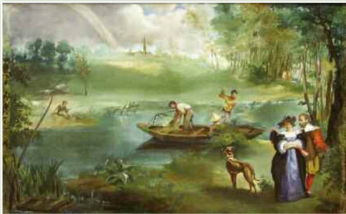
Fishing , Édouard Manet, c. 1862-3, Metropolitan Museum of Art.

There are only a few other 19th century French paintings that show Greyhounds in art, but there are two in the United States that have a link to Berthe Morisot. Her only art teacher of any repute was the landscape painter Corot (1796-1875), whose Bath of Diana is at the Dallas Museum of Art, while Fishing , by her brother-in-law Édouard Manet, is at the Metropolitan Museum of Art. ■