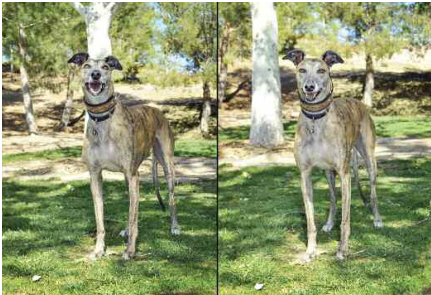
Changing your composition is easy. Breeze looks much better without the tree growing from her head.

When I crouch down and photograph my own dogs at eye level, they’ll inevitably get up, walk over, and try to slurp me or my camera. If you have someone to lend a hand, the process will be far more productive and far less frustrating. As a professional photographer, I always take an assistant with me to a shoot, or make sure in advance that the owners are willing to help. Recruit your own “assistant” (spouse, child, or friend) to keep some treats in hand to coax your hound to remain still. If the assistant stands right behind you holding a treat or a toy, your dog will probably look expectantly in your direction. (And if you and your assistant are willing to make some silly noises, all the better, because you will likely elicit some inquisitive looks from your dog.) Your assistant can negotiate with your dog when it appears he may no longer be interested in staying in your carefully chosen location. Having a helping hand is really the way to go.