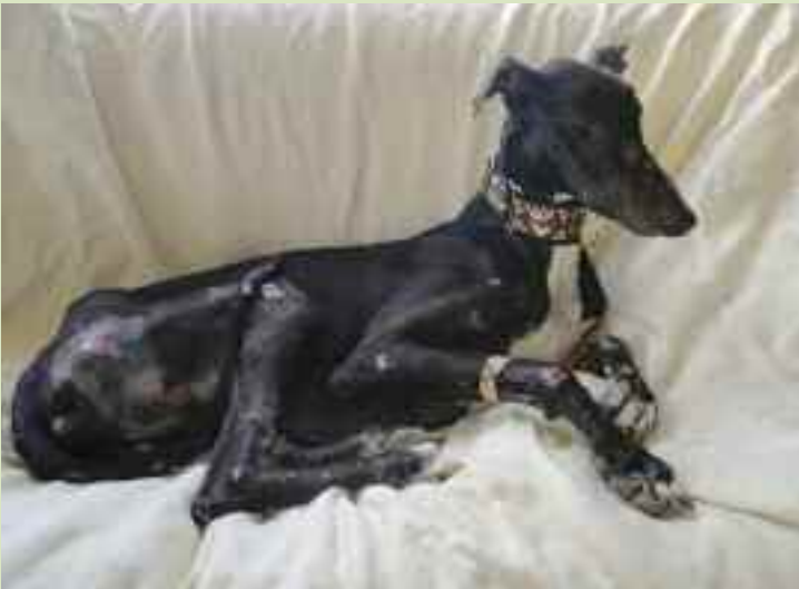
As Draco gained strength, he demonstrated more interest in his surroundings.