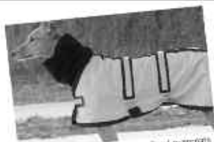
Warm, polar fleece-lined overcoat

For Over 8 Years, 100% of Our Profits Have Benefited Greyhound Rescue!