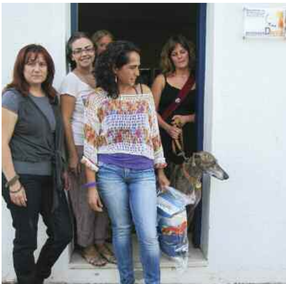
Ddevida volunteers pose with one of their Galgos.

the damaged lower jaw. After eight months of loving care, Sofie was ready for a new life. She is now living happily in California with three Greyhound brothers and sisters.