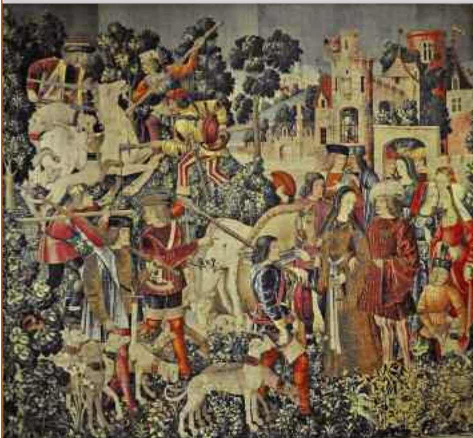
The Unicorn is Killed