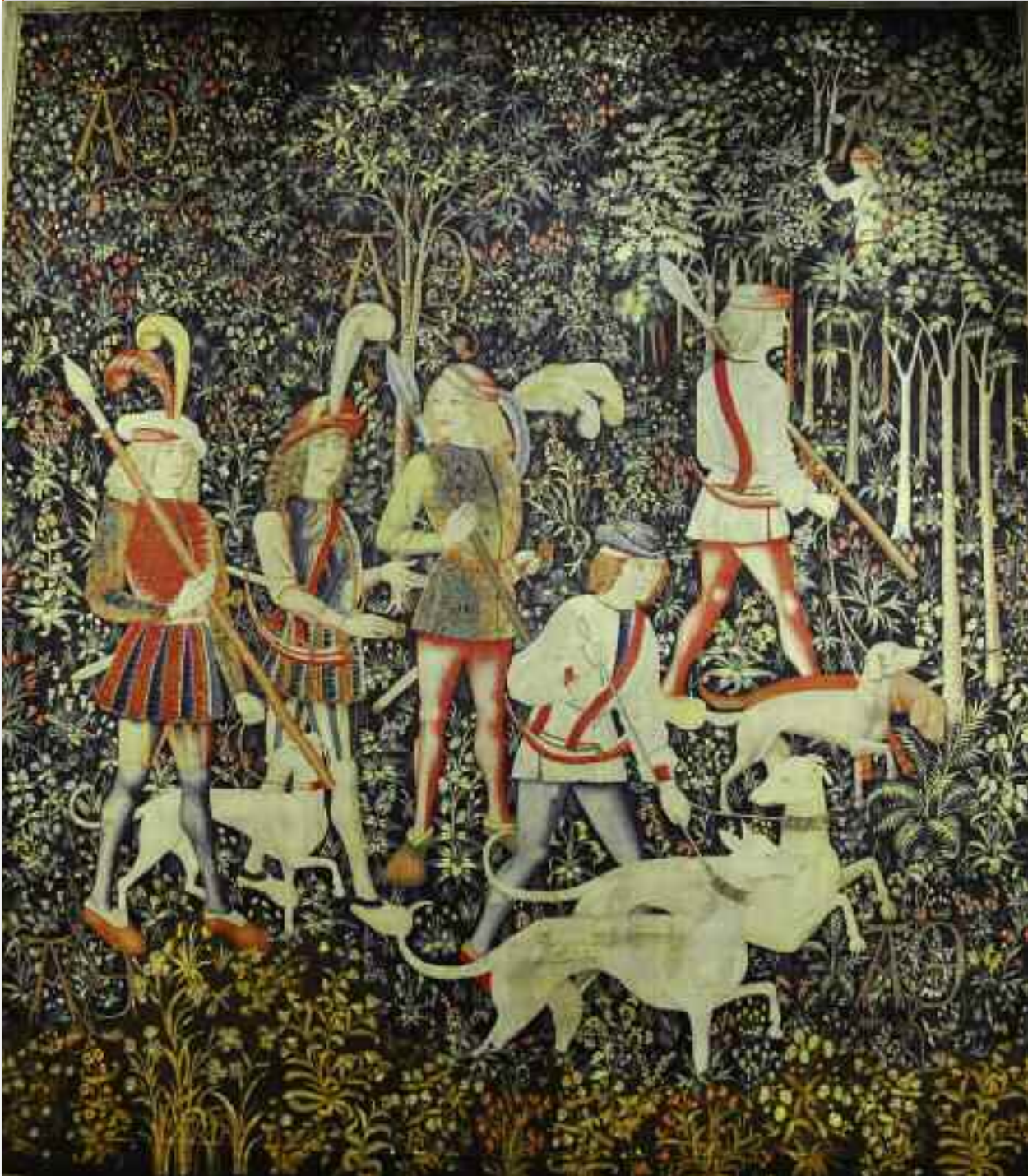
The Start of the Hunt

These six tapestries plus two fragments tell the story of a unicorn hunt, beginning with the start of the hunt, continuing with events in the hunt, the capture of the unicorn and his death, and finally, with the live unicorn in captivity. The interpretation of these tapestries remains a mystery. Details of the apparel of the men and women show that the tapestries were designed and woven around 1495 to 1505, probably by more than one artist, and were probably assembled from two sets. The six complete tapestries are each a little more than 12 feet