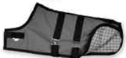
Raincoats with flannel lining