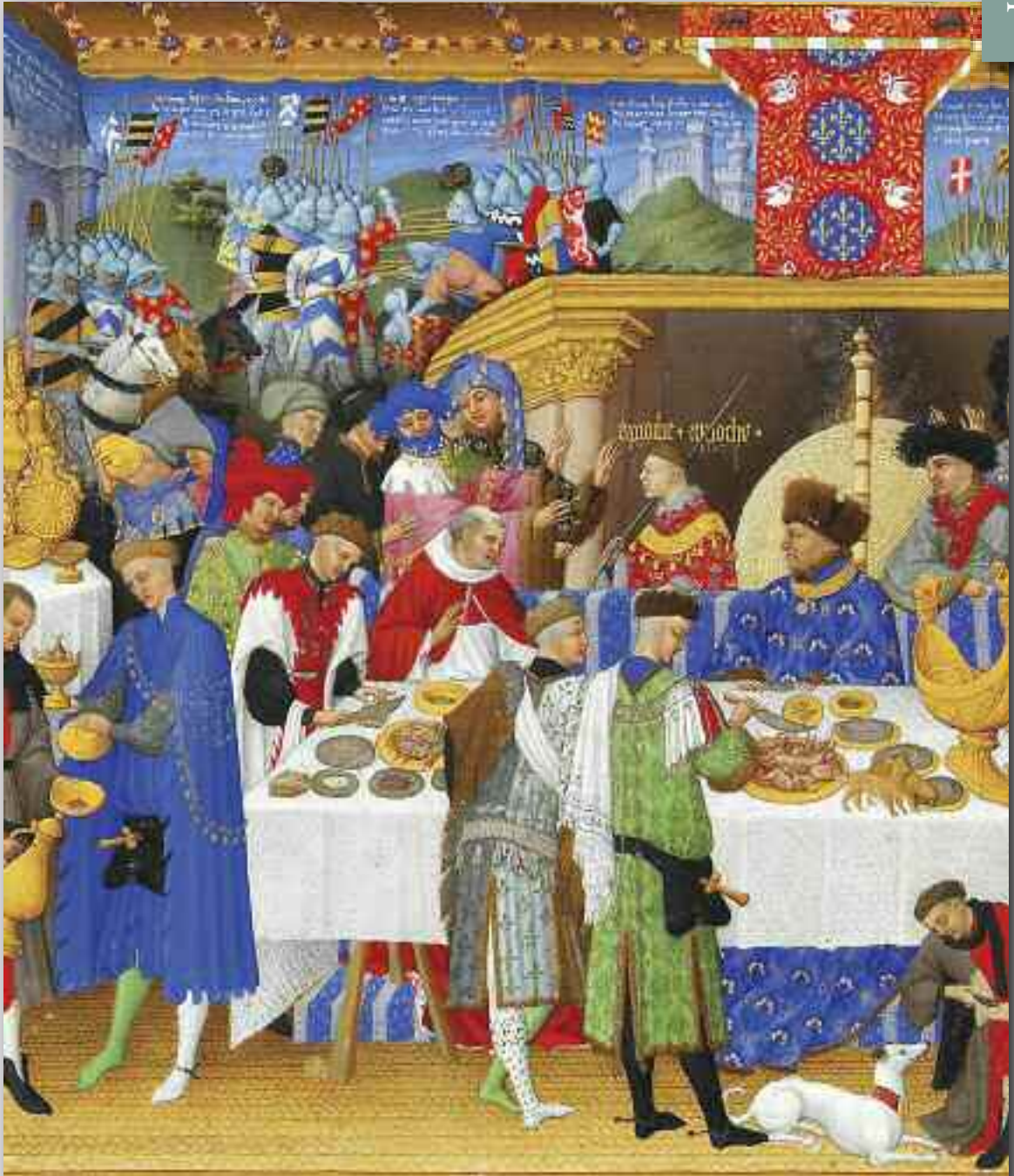
Très Riches Heures

In medieval times, as early as the 14th century, tapestries were one of the best ways for kings, princes, and other nobles to impress not only their peers but the public as well. As they traveled, the nobility would take their tapestries with them to provide a quick and easy way to furnish rooms, adding both beauty and insulation. The walls had metal hooks, allowing the servants of a visiting noble to line the rooms with tapestries. A page from an illuminated prayer book ( Très Riches Heures ) from approximately 1410 shows tapestries hanging in such a room, complete with a Greyhound. On great occasions, tapestries were also used to line a processional route. Tapestries