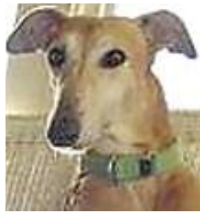
Nichole (Keepers Nichole) 2000 – 2011

therapy dog, Joey brought smiles to his nursing-home friends; a greyhound ambassador, he charmed potential adopters; and a universal blood donor, he shared his blood with dogs in need. In the flash of an eye, Joey would transition from a regal and dignified greyhound to a silly goofball who seemed oblivious to his lineage. While he couldn't keep pace on the track, Joey's greyhound friends couldn't hold a candle to him when it came to play. No one threw toys around with such reckless abandon as Joey. We all miss the class clown and hope that he left behind some of his exuberance for younger "brother" Wrigley. For now, the playroom is quiet, but Joey's spirit remains. One thing is certain. Wherever he is now, Joey has found the most comfortable bed there.