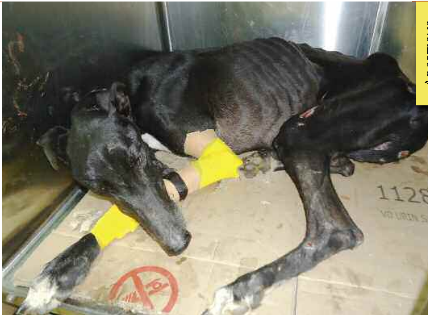
Draco arrived from Jerez in bad shape.