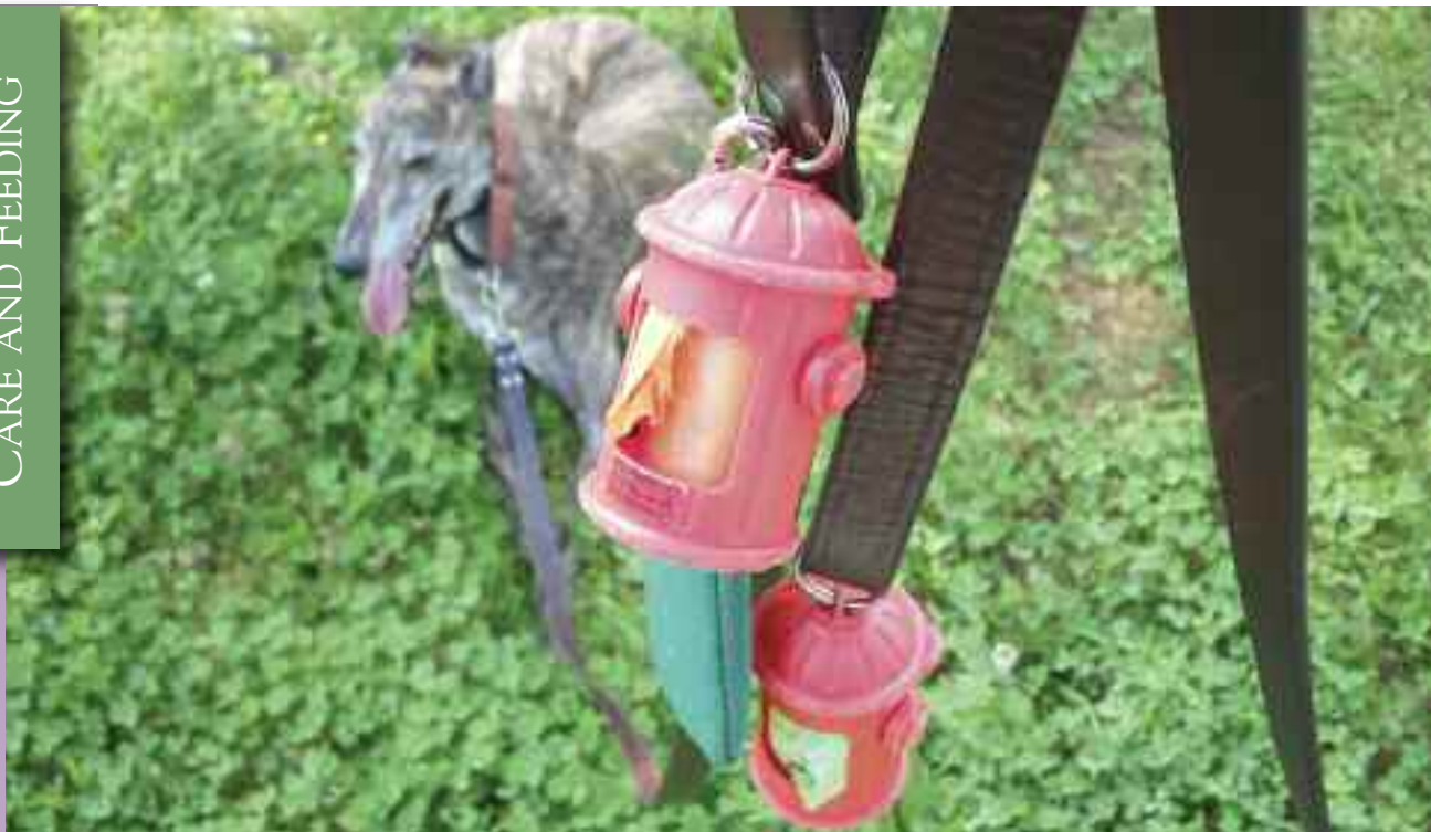
Practicing doo-doo diligence is an important part of being a responsible Greyhound owner.