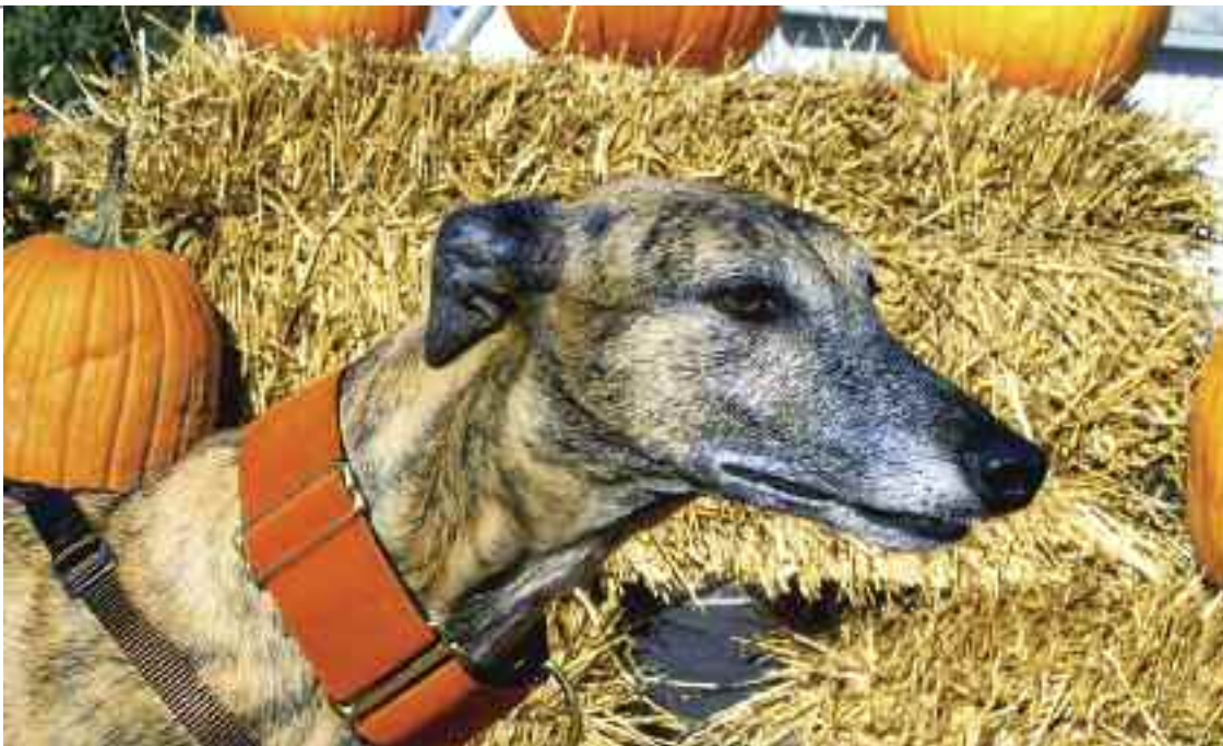
Kit (Silver Skittles), adopted by Sandy and Jim Volschow of Woodville, Ohio.