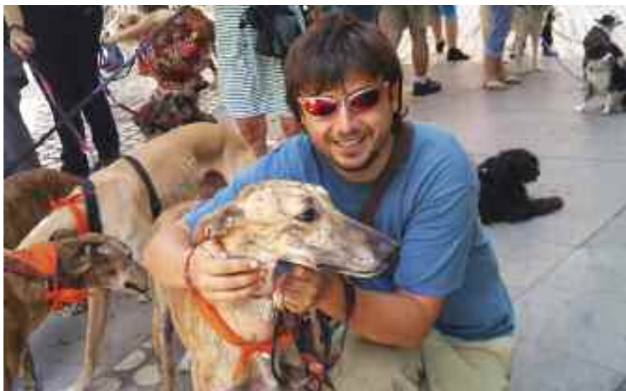
A volunteer and his Galgo.