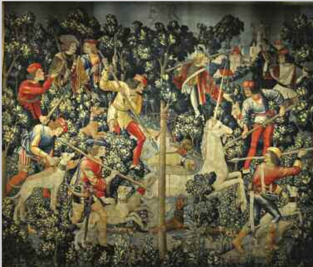
The Unicorn Leaps the Stream

in height, and vary from approximately 8 to 14 feet in width, nearly 71 feet in all. We show only the five panels with Greyhounds.