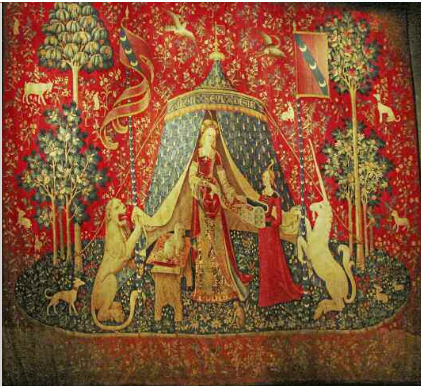
À mon seul désir