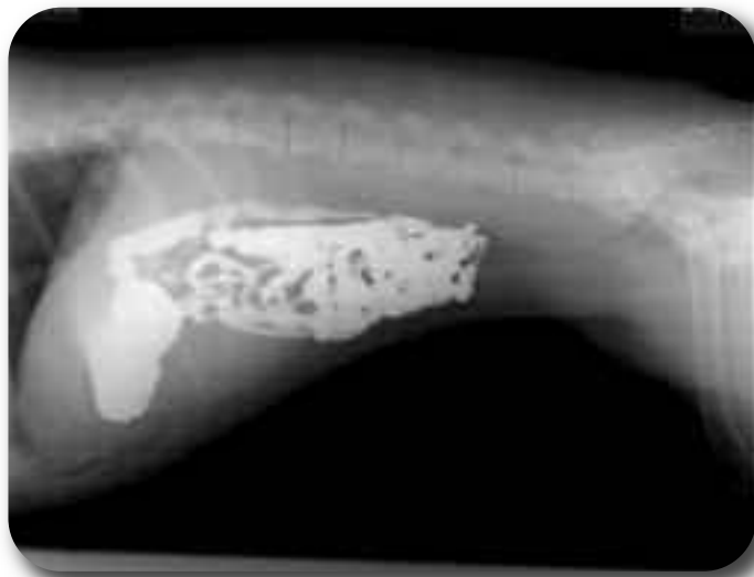
A dog undergoing an x-ray to examine the intestinal tract will often receive barium as an illuminating contrast agent. Here, barium moves from the stomach through the intestinal tract.