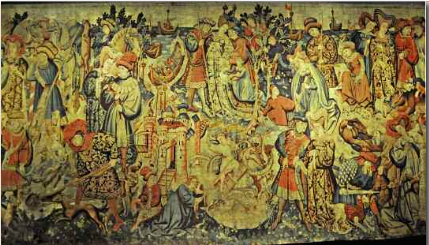
Otter and Swan Hunt