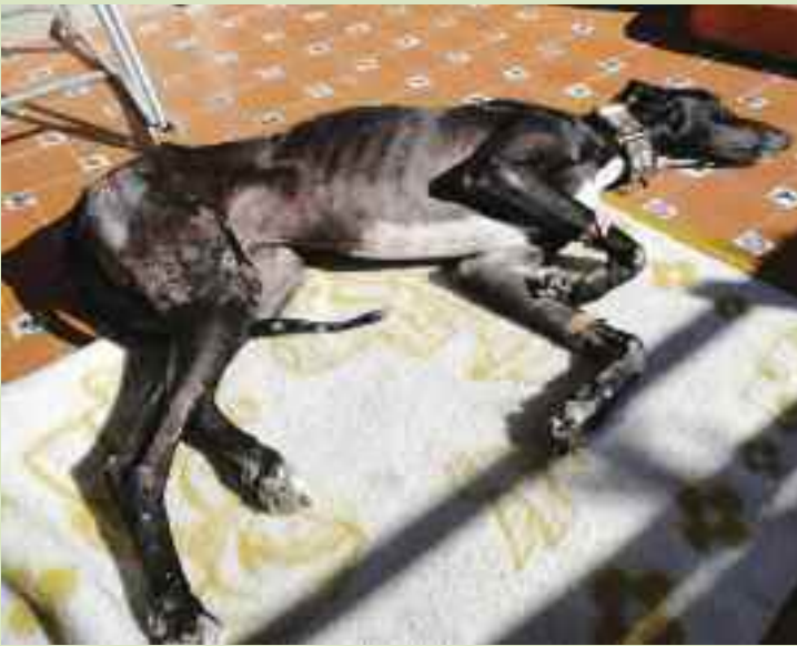
Draco's wounds began to heal with love and veterinary care.