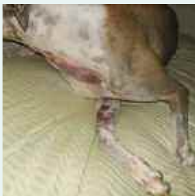
Rita's leg and neck bleed at its worst.

and thank her for protecting me. If the dog comes from behind, my only option is to pull her close. All this is bothersome, but she has lunged at kids on skateboards who pass us on sidewalks and I know what happens to dogs who bite children. Any behavioral suggestions? We have cats and she is fine. My guess is that she sees outdoor dogs as prey.