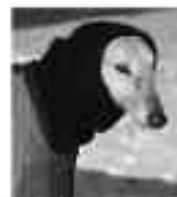
Polar fleece neck warmers