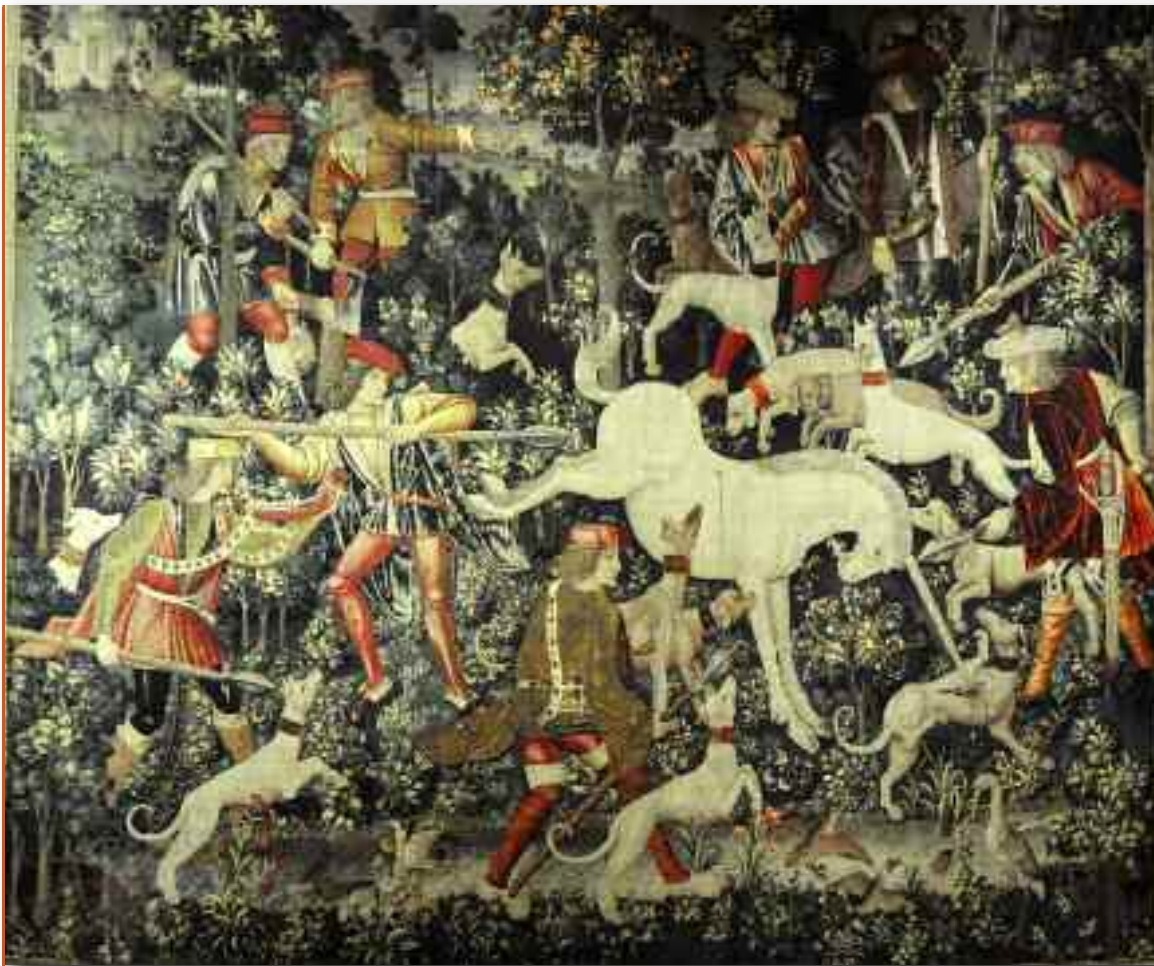
The Unicorn Defends Himself