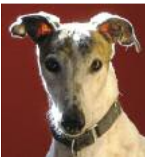
Joey (Folk Art) 1999-2011