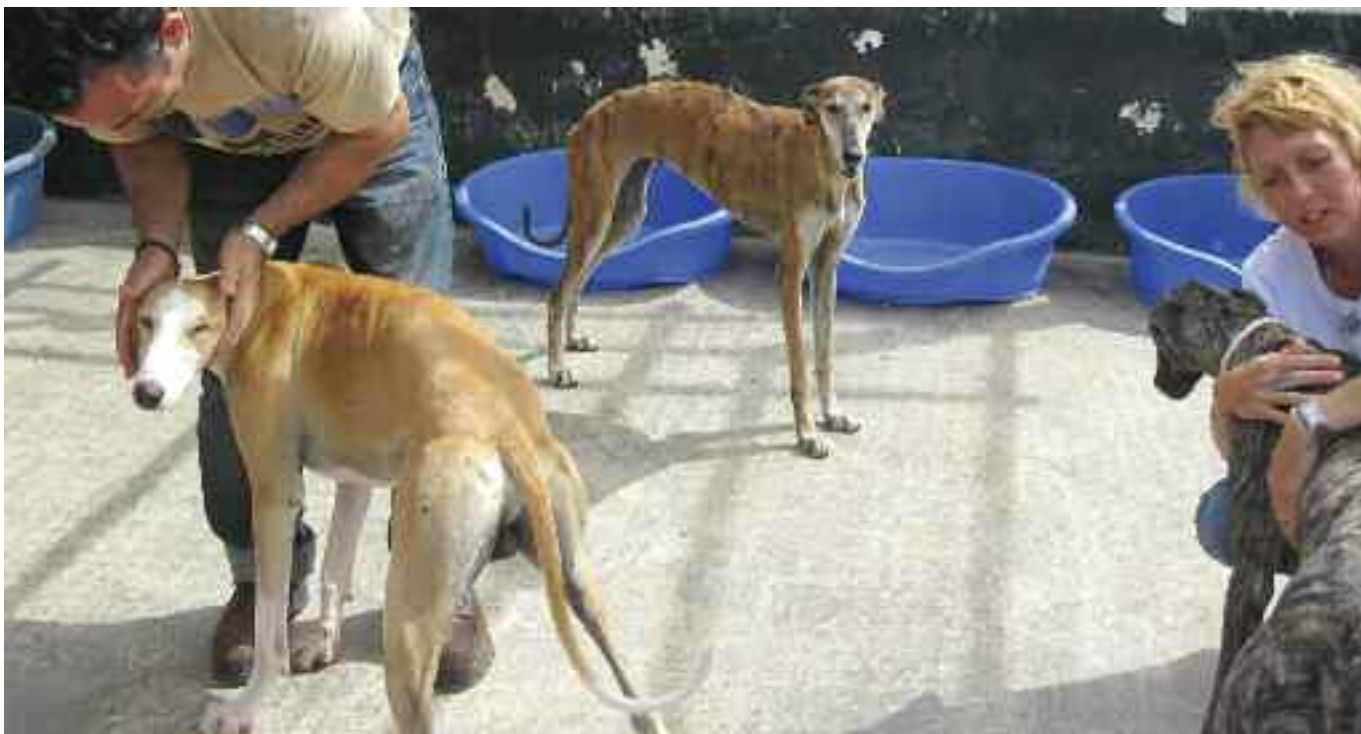
Volunteers at the San Anton shelter give the Galgos some much-needed love.

the building was in a shambles, not one of the dogs in the shelter was seriously hurt.