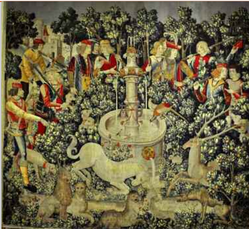
The Unicorn Dips His Horn into the Stream to Rid It of Poison