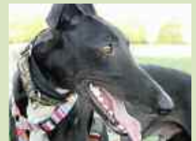
Draco found a forever home in Germany, where he receives lots of love and attention and exercise and looks forward to a bright future.