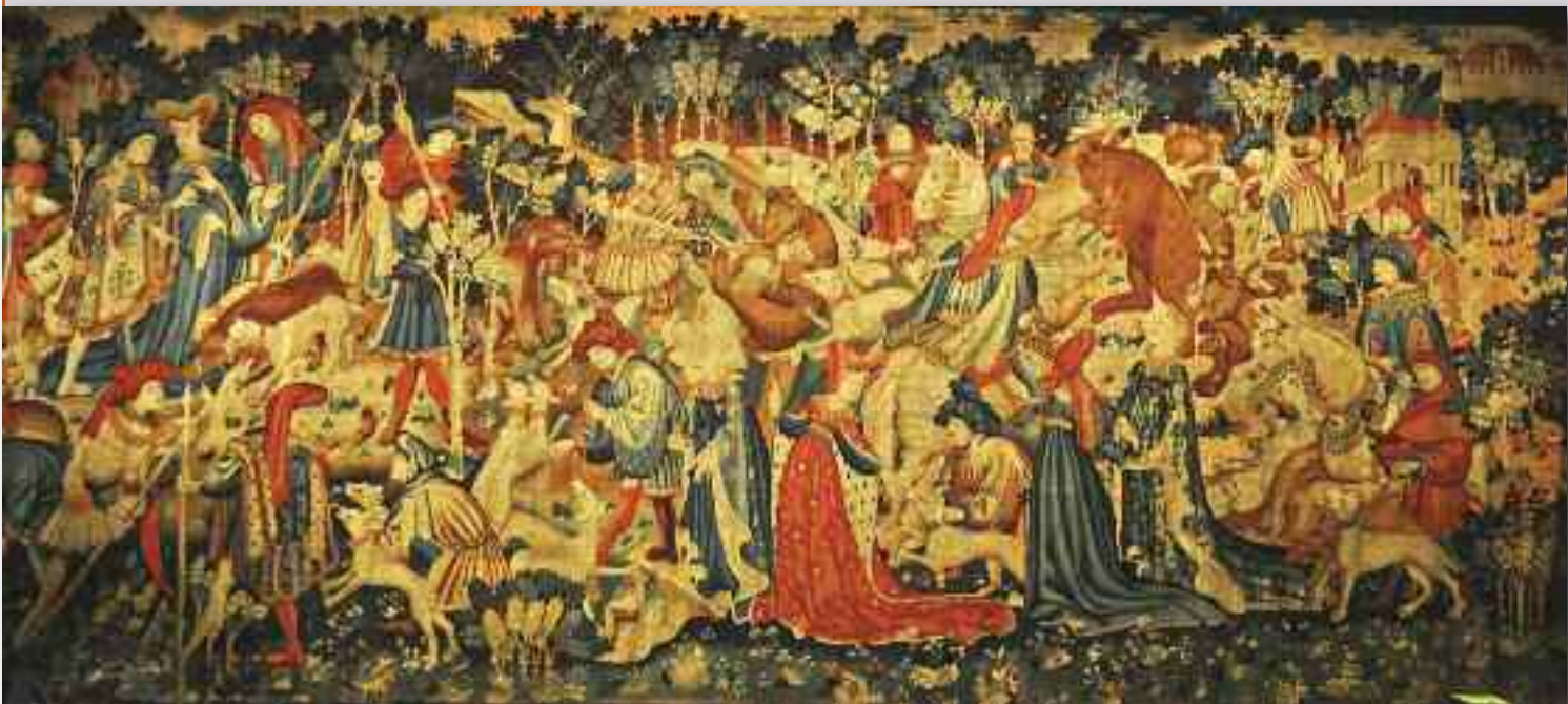
Boar and Bear Hunt

Longtime readers of Celebrating Greyhounds may remember “Hunting Tapestries” (Spring 2001 CG). That article focused on Greyhounds in the hunt and on their collars, and presented a great deal of interesting information on both subjects. This article focuses more on the tapestries in which Greyhounds have appeared, and on what the Greyhounds are doing there.