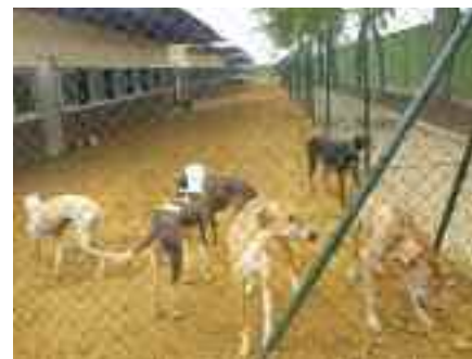
The Recovery Center for Galgos will open its doors later this year.

Fundacion Benjamin Mehnert Sevilla, Spain www.fundacionbm.com