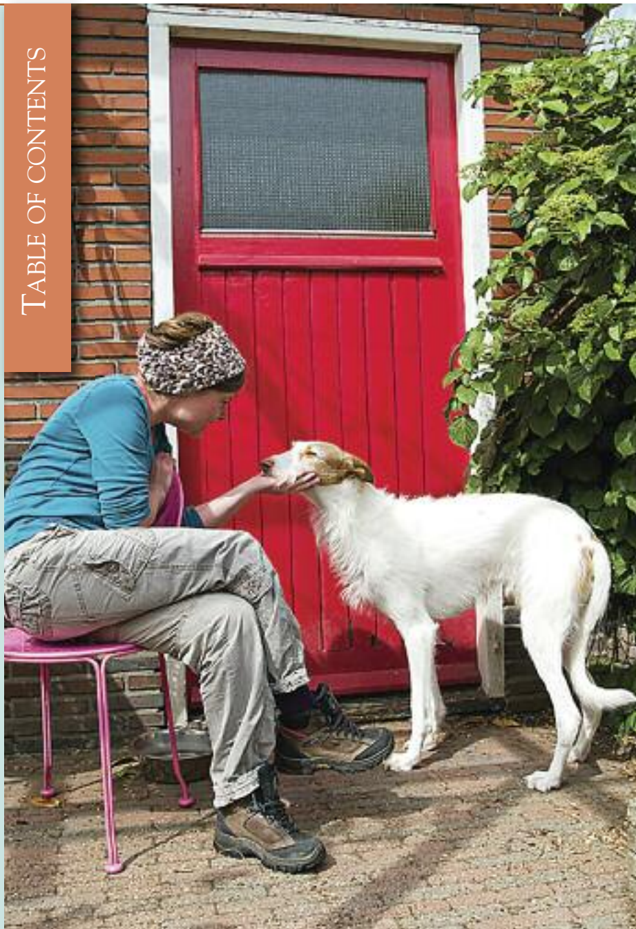
Barajas, a Podenco who found his way to the San Anton shelter, was eventually placed in a home by GreyhoundsRescue Holland.