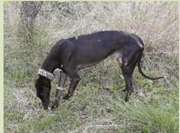
Gentle exercise contributed to Draco's recovery.