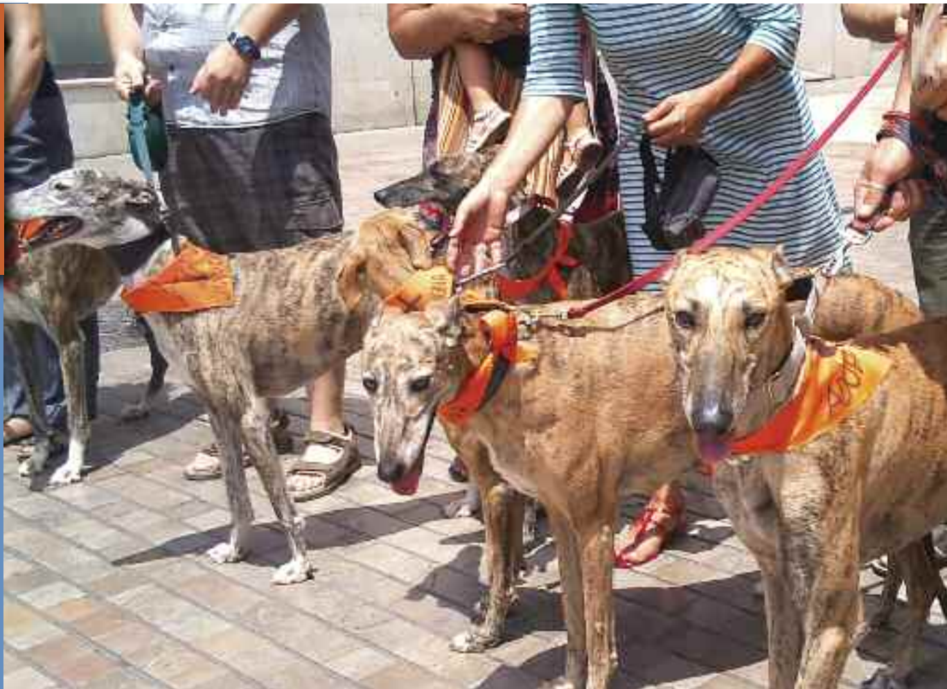
Galgos strut their stuff with volunteers on a Sunday walk.