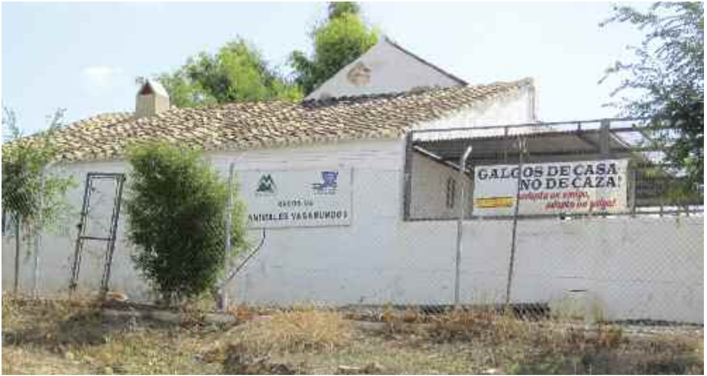
The San Anton shelter, based in Villamartin, assists over 200 Galgos a year.

mote hunting with Galgos. At the end of each hunting season, the abandonment of Galgos occurs all over Spain. The Spanish “animalistas” (animal welfare advocates) promote micro-chipping, penalties for abandonment, and laws to protect hunting dogs. However, the hunters or “galgueros” have strong political ties in municipal governments, so change comes slowly to the hunting world.