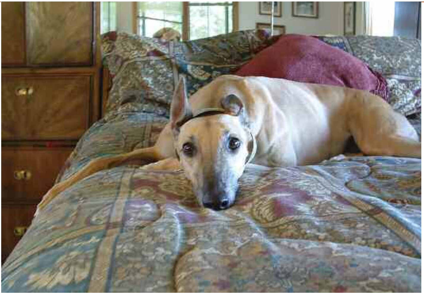
Order is restored . . . Lizzie has access to the master bedroom again.

Picture this: a 75 lb dog lying on the floor with her tail tucked so far under her body you don't know she even has a tail. Back legs are hunched under her tummy, right hip plastered to the floor, and as your eyes follow her spine, you see it curved in a graceful "S" shape up to her shoulders, first to the right and then a gentle sweep to the left where you see her left shoulder flat against the floor. Her neck has the same sweeping arc back to the right where you see her nose tucked under her right shoulder, with her front legs askew at awkward angles as they keep the whole sculpture from tumbling over.