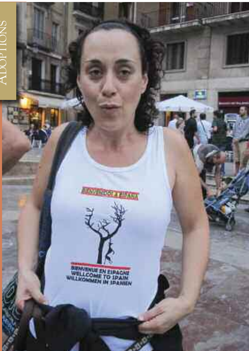
This animalista, encountered during an animal rights march in Valencia, is representative of the increasing concern in Spain over the condition of the Galgo.