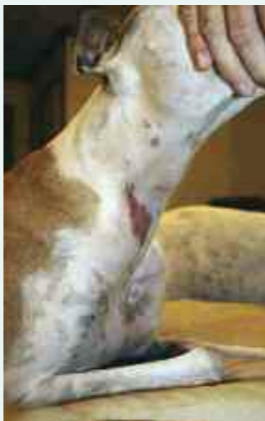
Rita's neck bleed at the beginning.

We are the proud parents of two 4-year old Greyhounds, a male and a female. We are having a problem with our girl dog and don't know what to do. She seems to want to rip the lungs out of every dog she meets. Her tail wags furiously, but she barks and strains at the lead. We know her vision is poor; originally she would freak if a dog approached her from the side. She's OK with some dogs, but we never know when a dog will set her off. The dog could be approaching her, or it could be in a fenced yard at some distance. She has never had problems at doggie day care or at the home of our dog sitter (who has four Greyhounds). If I see a dog approaching us, I pull her in close, pet her,